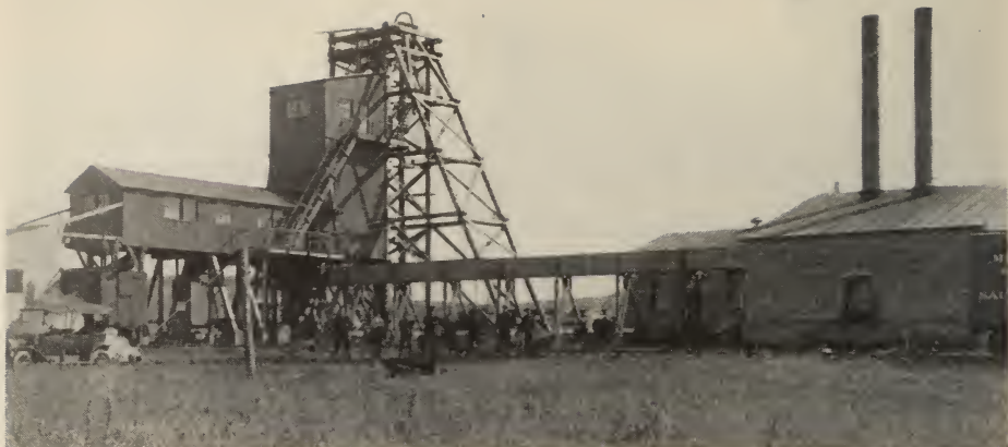
WASHBURN LIGNITE COAL COMPANY AT MILTON, NORTH DAKOTA

Grant, the Indian reservations of the United States were divided among the various religious communities of the country. Those reservations which are now in the state of South Dakota and in the diocese of Duluth in Minnesota were assigned to the Protestant Episcopal Church. The reservations which are now in the state of North Dakota were assigned to the Roman Catholic and Congregational Churches. The great work done by the Protestant Episcopal Church has therefore been done in the state of South Dakota and in the northern part of Minnesota under the leadership of the late Bishop Hare and the late Bishop Whipple.